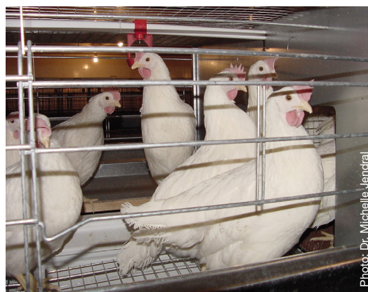
■ Hens outside nest box in furnished cage.

Battery cages do not provide hens with nests, and there is typically only one nest area per furnished cage. 5 Because the largest furnished cage systems in North America are designed to house up to 60 (possibly up to 115) (LayWel, 2006) birds and nesting has become a gregarious behaviour pattern that hens like to perform together, they may have to compete to use the nest area. Some will choose to stay in the nest area when not laying eggs, as it is the only private area where a hen can seek refuge from the other birds. Since hens prefer a private nest area, this prevents other hens from laying their eggs in the occupied area.