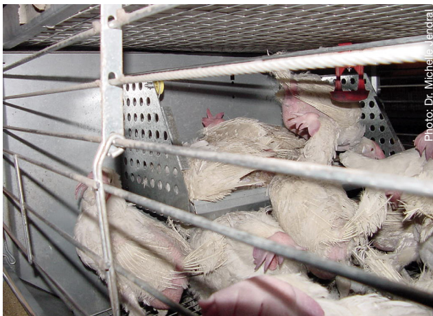
■ Hens compete to use dustbath in a furnished cage.

Dustbathing is a natural behaviour which helps to remove stale oil and damaged feathers to keep hens' plumage in good condition (Olsson & Keeling, 2005; Shields, 2004; Van Liere & Bokma, 1987). Battery cage systems do not provide hens with either space or litter to dustbathe. Not all furnished cage models have dustbaths, and those that do, cannot provide