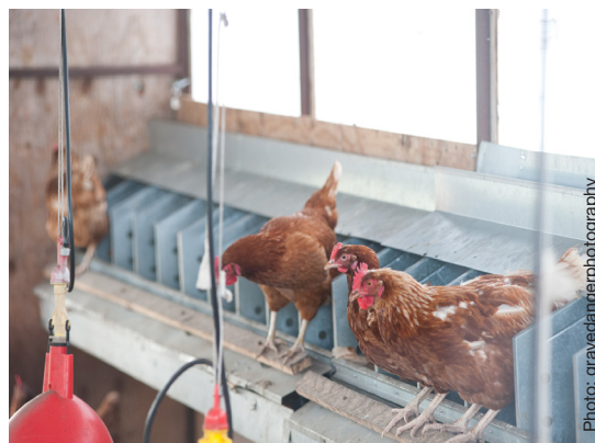
■ Multiple nest boxes in a cage-free system.

In cage-free systems, hens typically have multiple nest boxes to choose from and studies show they will inspect many potential nest sites before making a choice (Meijsser & Hughes, 1989). The Canadian Recommended Code of Practice suggests that free-run egg farms provide 20 nests for every 100 hens, and the British Columbia Society for the Prevention of Cruelty to Animals (BC SPCA) requires farmers to adhere to this ratio in order to receive their certification. The cage-free guidelines adopted by UEP (2010), recommend 9 ft 2 (.84 m 2 ) of community nest space per 100 hens.