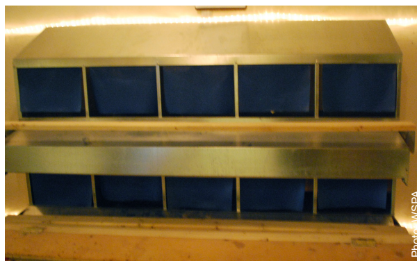
■ Multiple nest boxes with privacy curtains.

The proper construction and availability of suitable nest sites will help reduce the occurrence of floor eggs (Appleby, 1984; Appleby, Hogarth & Hughes, 1988; Duncan & Kite, 1989). Providing more nest choices and suitable nesting material, like peat or artificial turf, will encourage hens to lay eggs in the nest area (Rodenburg et al., 2005). Ensuring that nest boxes are secluded and the floor area is well lit will also discourage floor laying.