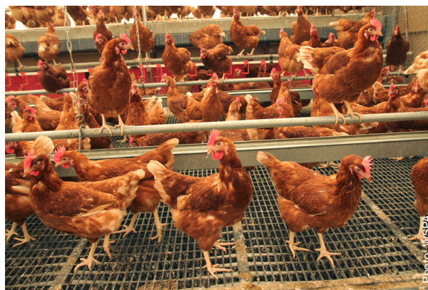
■ The perches, feeders and drinkers are over the slatted floor at Rabbit River Farms in Richmond, B.C.

Collecting floor eggs soon after they are laid will discourage other hens from laying their eggs in the same location, and placing those eggs in the nest site will help hens find the appropriate laying area. Hens can also be encouraged to defecate on slats or perforated platforms so that manure can be removed from barns by conveyor belt and stored or composted immediately. Some farmers have effectively accomplished this by positioning the feeders, drinkers and perching areas above slatted floors (S. Easterbrook, personal communication, June 20, 2012).